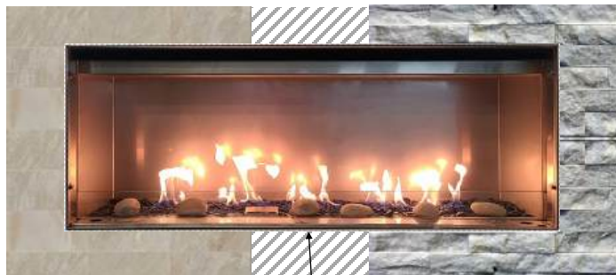
Finish up to edge