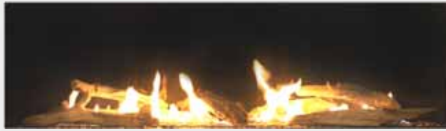
DWLS 7PC log set for 45/55/65 series