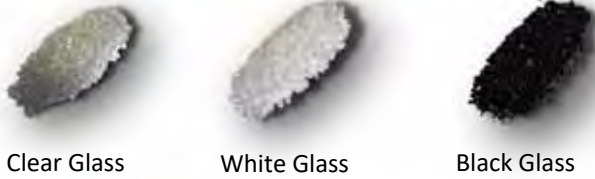
Clear Glass White Glass Black Glass