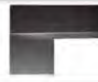
Finish to fireplace