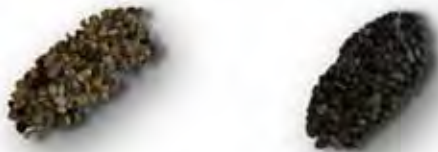
River Pebbles Grey Pebbles