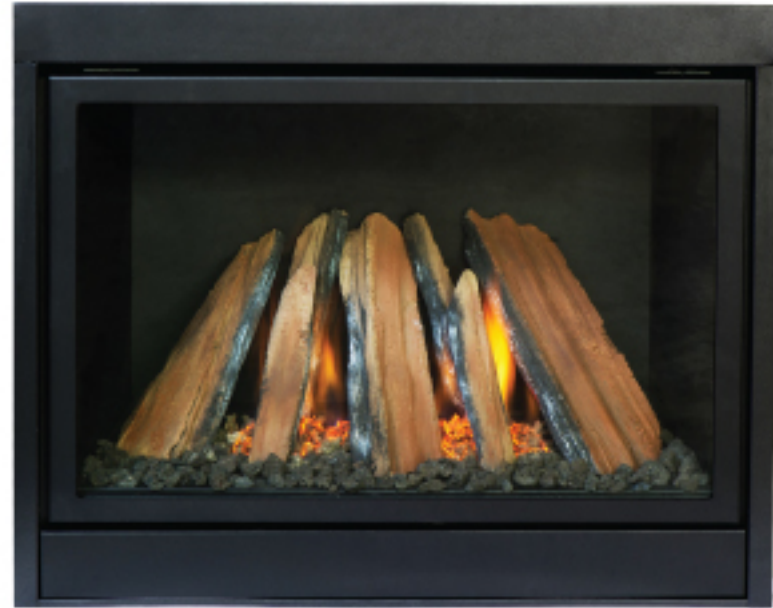
*DCF42 shown here with designer 7 pc log set